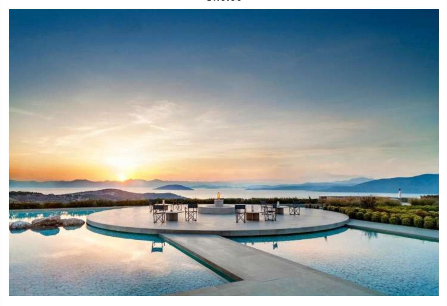
Day 7 Accommodation: 4 or 5* Hotel of Choice