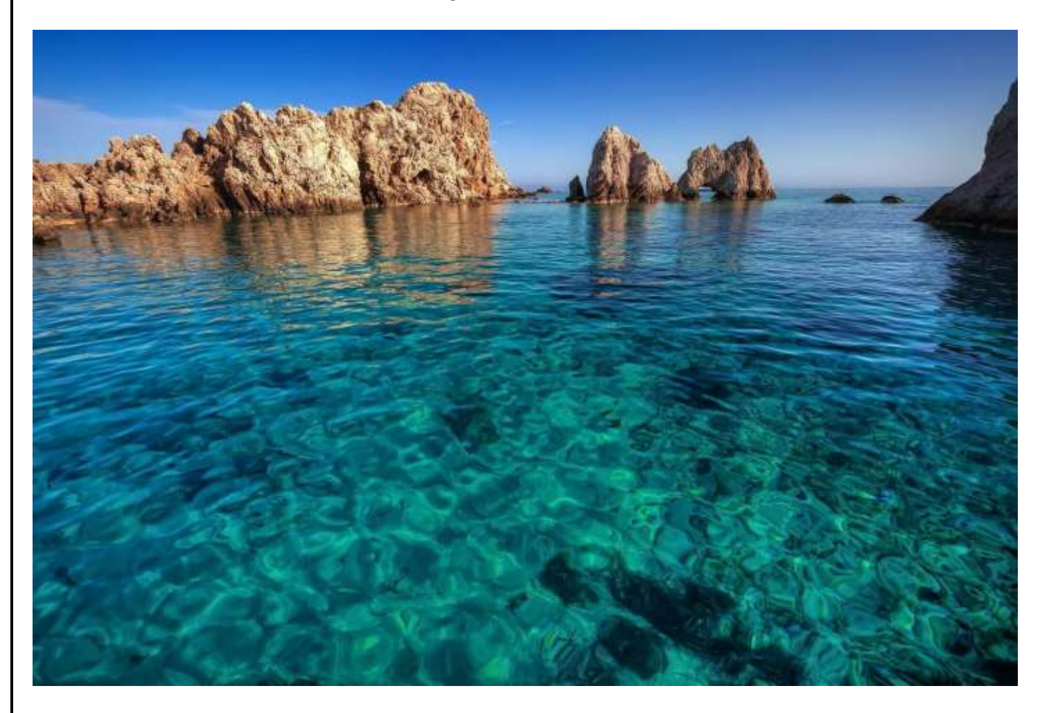
Day 10 Private Cruise to Antiparos on Sealink 1 or 2 from Paros

This rib boat adventure is perfect for those seeking to experience the ultimate in Greek island hopping. Spend the day discovering off-the-beaten-track beaches, coves, and riches of the Cycladic islands. Explore Paros and Antiparos, swim and snorkel in the aquamarine waters and revel in the untouched nature.