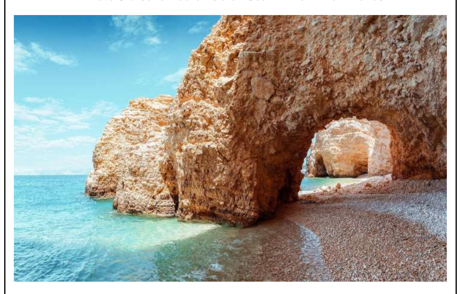
Day 6 Private Cruise to Koufonisia on Sealink 1 or 2 from Naxos

This rib boat adventure is perfect for those seeking to experience the ultimate in Greek island hopping. Spend the day discovering off-the-beaten-track beaches, coves, and riches of the Cycladic islands. Explore all the parts of the islands that are not accessible by foot or car, swim and snorkel in the aquamarine waters and revel in the untouched nature.