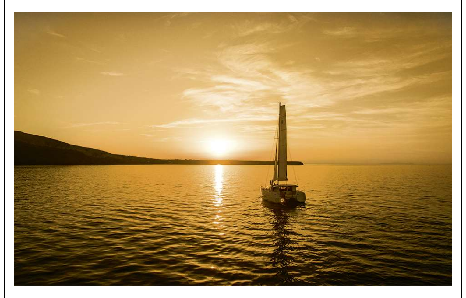
Day 10 Private Sunset Cruise on Lagoon 380 or 400

There's no better way to explore the crystal blue seas and islands around Santorini than a private sunset catamaran cruise on an exclusive Lagoon 380 or 400. In the warm sunshine, you will sail past some of the best-known Santorini landmarks and beaches and experience the unique opportunity of sailing into the spectacular caldera. This luxury cruise includes an unforgettable barbeque paired with Santorini's finest wine and beverages whilst relaxing onboard. With the exclusive Lagoon 380 or 400 sail yacht, you could partake in one of the following activities: sail into the breathtaking caldera where you will be able to swim and have an incredible mud bath by the volcanic hot springs, visit both Red Beach and White Beach for swimming and snorkeling, sail leisurely past Thirassia, a small island formed in recent centuries by volcanic activity, enjoy a delicious barbecue on board before admiring the spectacular Santorini sunset.