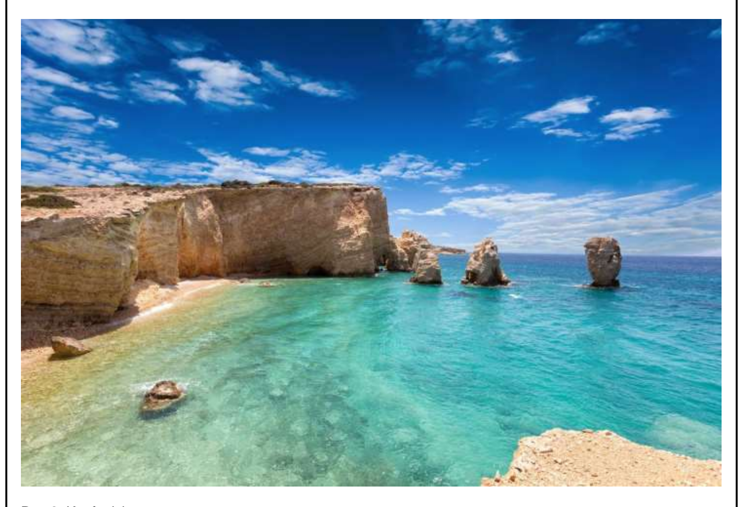
Day 3: Koufonisia

The island group is famous for its natural pools and the uninhabited Keros Island.