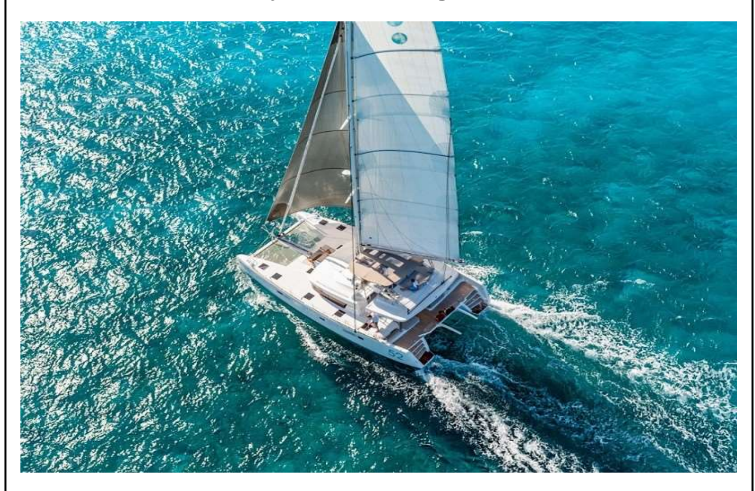
Day 12 Private Daytime Cruise on Lagoon 380 or 400

There's no better way to explore the crystal blue seas and islands around Santorini than a private catamaran cruise Cruise. In the warm sunshine, you will sail past some of the best-known Santorini landmarks and beaches and experience the unique opportunity of sailing into the spectacular caldera. This luxury cruise includes an unforgettable barbeque paired with Santorini's finest wine and beverages whilst relaxing onboard. You will start your sailing adventure Ammoudi port, continue below the Caldera and make your first stop at the Hot Springs for swimming and an incredible mud bath. Your journey will continue past Aspronisi, the ancient lighthouse, Akrotiri and Indian Rock before making your second stop at the White Beach for some fun water activities, swimming, and snorkeling. While on anchor you will also indulge in a delicious barbeque paired with Santorini wines and refreshments. After your batteries are recharged, it is time for the third stop at the Red Beach for your final dip of the day before you return to shore.