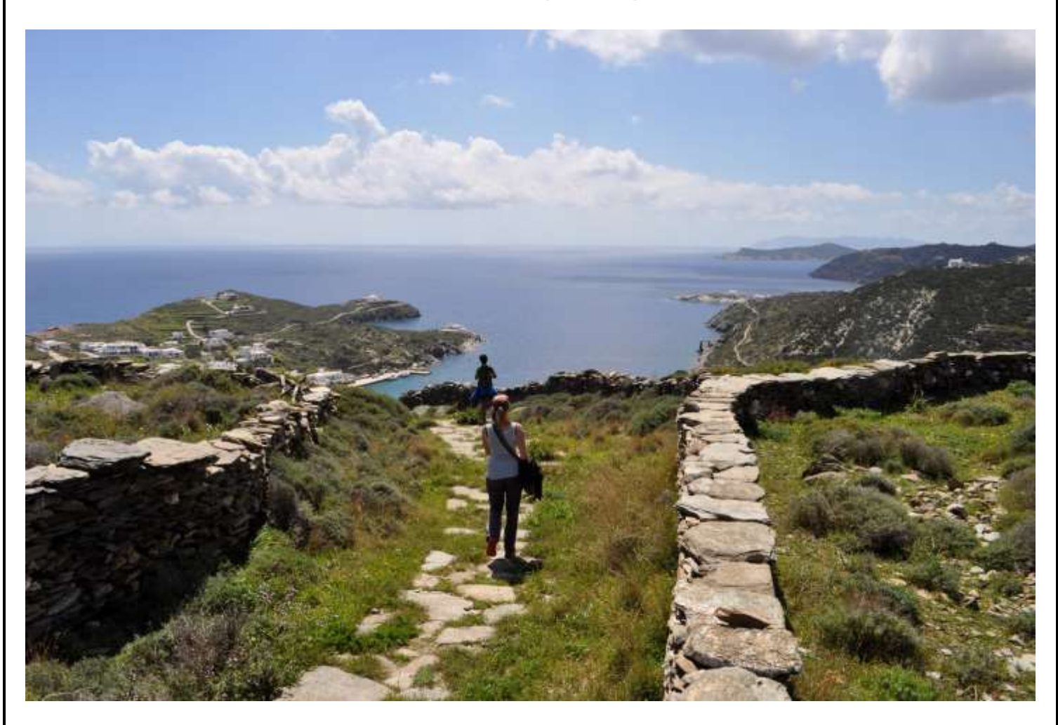
Day 8 Private Trekking/Hiking Tour

Sifnos has almost 100km of well-marked and cleared hiking trails for those who wish to keep fit, explore the island away from the crowds, discover the history and myths of Sifnos and secret corners of great architectural value or simply wander observing the unique herbs & flora of the Cyclades.