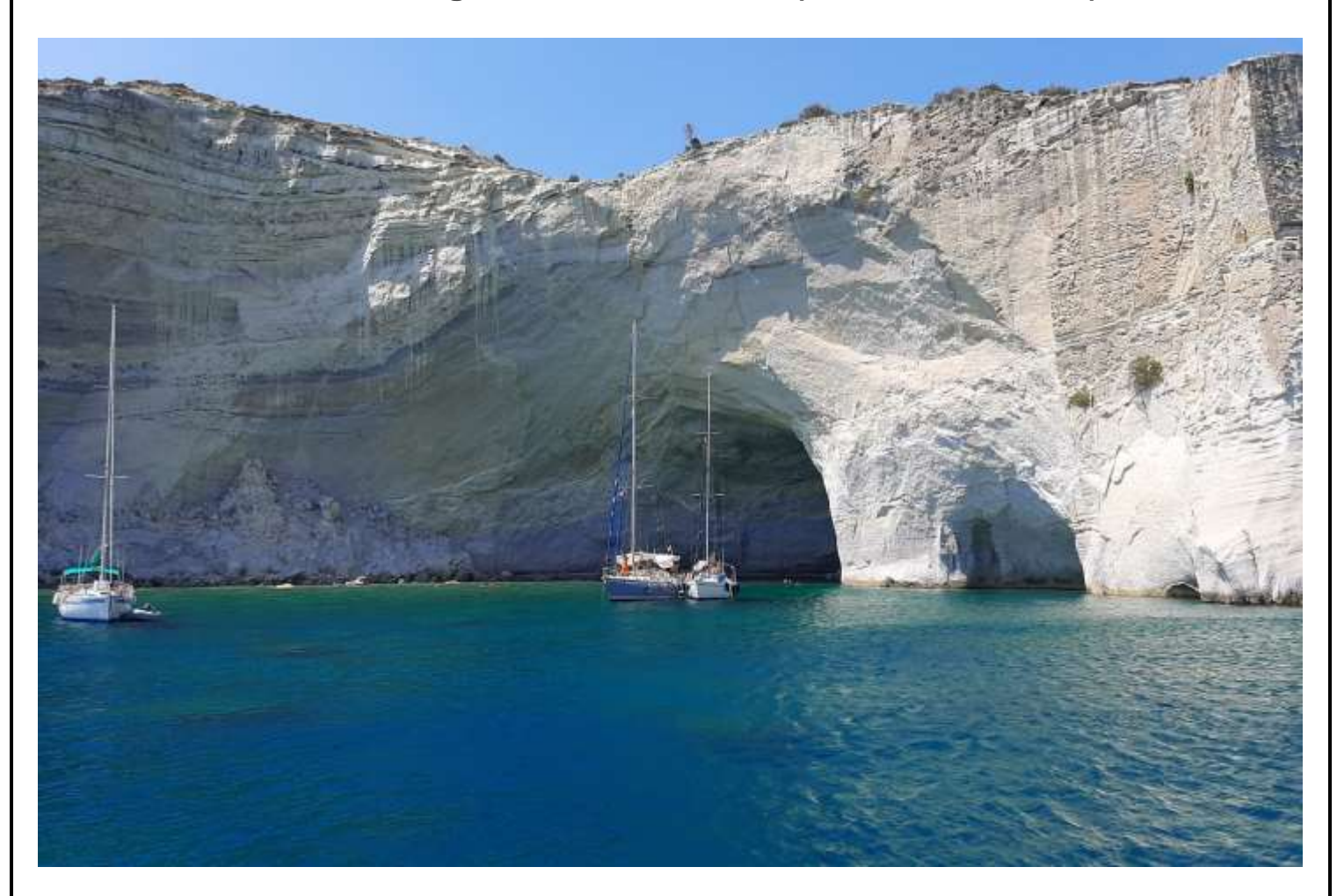
Day 5 Private Sailing Cruise Round Milos (Adamas – Kleftiko)

After meeting the crew at Adamas port, you will board the spacious boat and start your private sailing adventure. Passing the coastline and leaving the Milos bay behind, you will sail past traditional fishing villages of Skinopi, Klima, Areti, and Fourkovouni adorned with picturesque little houses -called "sirmata"- built by the seaside. Then you will visit Arkoudes, lava rock complex which takes its name from its characteristic shape; the form of a bear. Opening the sails you will then head to the impressive Cape Vani. Your first swimming stop will be at the natural bay of Kalogries, where you will be able to dive into the transparent turquoise waters right from the yacht. Your next wow-stop is the colorful beach of Agios Ioannis that follows the stunning Sikia cave. Here you will be able to use the snorkeling equipment on board in order to fully enjoy this unique location. Your final stop is at the famous old pirate bay Kleftiko with its numerous caves and crystal clear. Dive in, snorkel or just bask in the magnificent view after which your delicious meal will be served onboard.