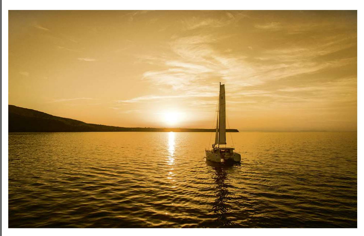
Day 11 Private Sunset Cruise on Lagoon 380 or 400

There's no better way to explore the crystal blue seas and islands around Santorini than a private sunset catamaran cruise on an exclusive Lagoon 380 or 400. In the warm sunshine, you will sail past some of the best-known Santorini landmarks and beaches and experience the unique opportunity of sailing into the spectacular caldera. This luxury cruise includes an unforgettable barbeque paired with Santorini's finest wine and beverages whilst relaxing onboard. With the exclusive Lagoon 380 or 400 sail yacht, you could partake in one of the following activities: sail into the breathtaking caldera where you will be able to swim and have an incredible mud bath by the volcanic hot springs, visit both Red Beach and White Beach for swimming and snorkeling, sail leisurely past Thirassia, a small island formed in recent centuries by volcanic activity, enjoy a delicious barbecue on board before admiring the spectacular Santorini sunset.