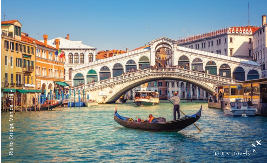
Rialto Bridge, Venice - Italy